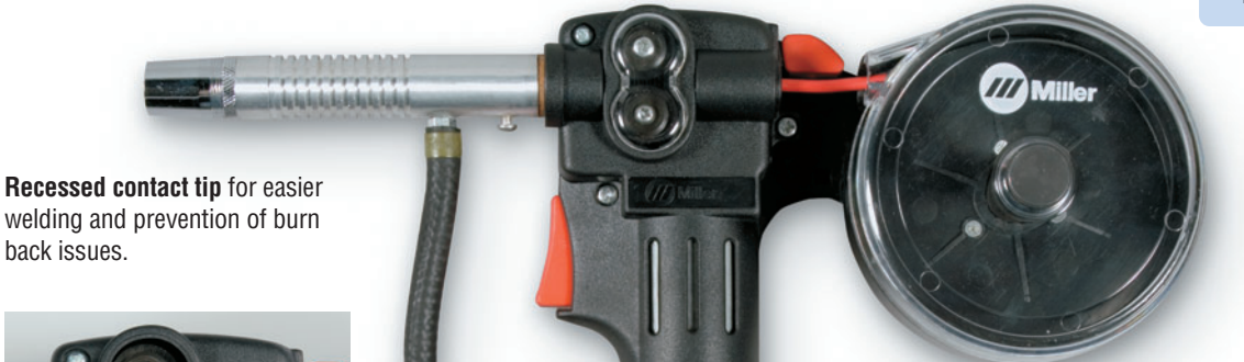
Clear spool cover

allows the user to see the amount of wire left before it runs out.