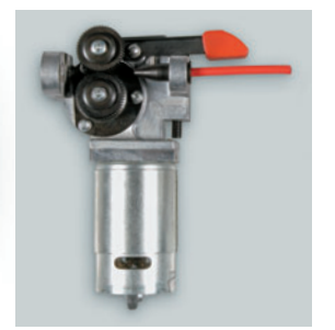
Heavy-duty drive motor and cast aluminum gearbox.