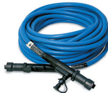
ProHeat liquid-cooled induction heating cable shown.

Designed with flexibility in mind, the ProHeat liquid-cooled induction heating cables can be wrapped into coils of various shapes and sizes to fit almost any induction heating application. Great for applications with geometries and temperatures that prevent the use of air-cooled blankets.