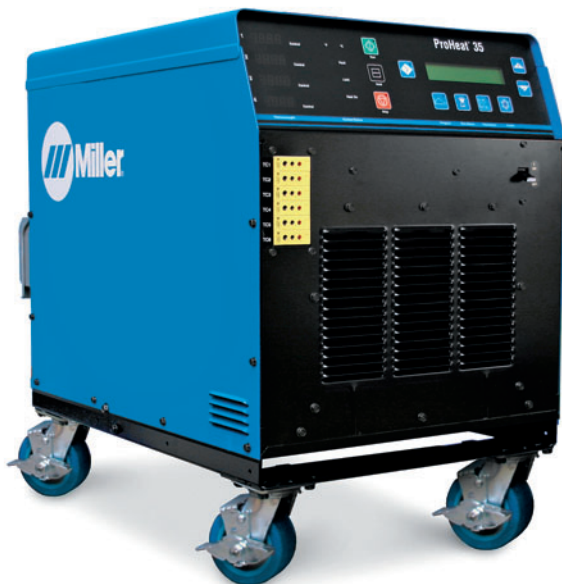
ProHeat 35 power source shown with optional running gear (195436).

Improved working environment is created during welding. Welders are not exposed to open flame, explosive gases and hot elements associated with fuel gas heating and resistance heating.