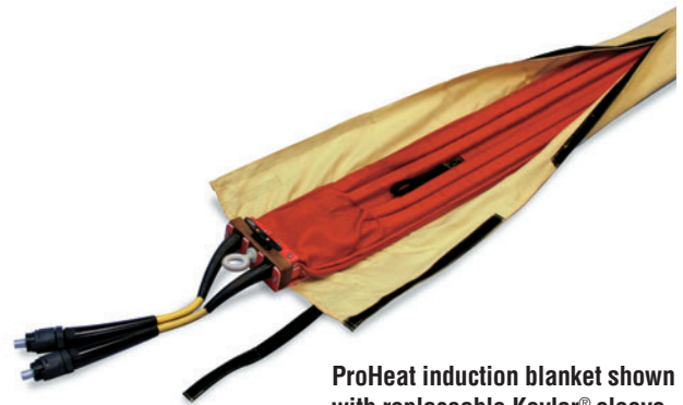
ProHeat induction blanket shown with replaceable Kevlar® sleeve.

The blankets easily conform to circular and flat parts and install in a matter of seconds. Manufactured from durable high-temperature materials, flexible induction blankets are designed to withstand the tough conditions in both industrial and construction applications.